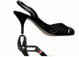
Ladies dowel heels

Ladies' Heel may be made of rubber, leather, or other material, serving as the thin layer that touches the ground and goes under the heel of the foot.