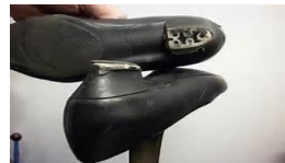
Ladies reg toplifts