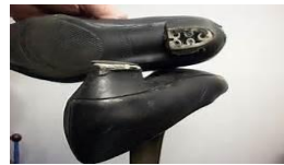
Ladies reg toplifts