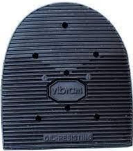
Vibram rubber cowboy heels