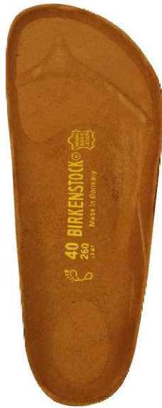
Birkenstock footbeds regular & narrow width.