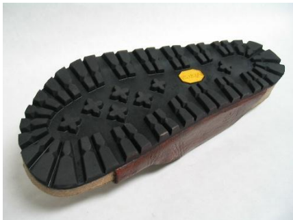
Vibram rubber sole with midsole $125pr