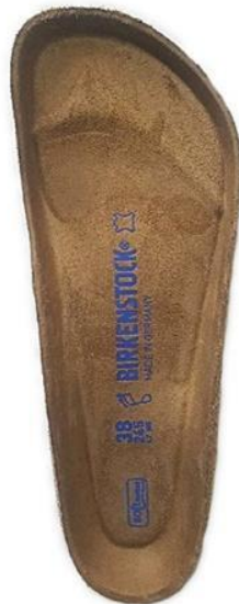
Birkenstock soft footbed, reg width only